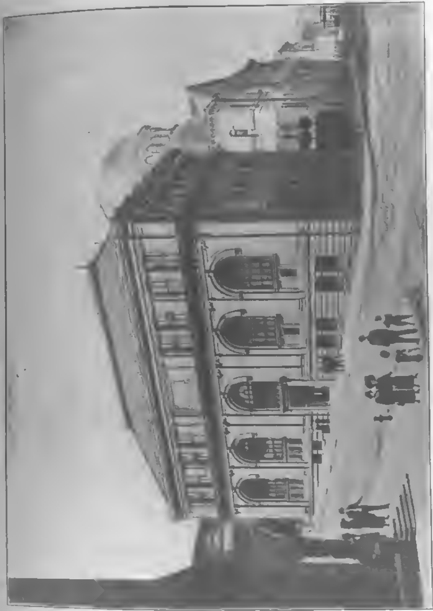
THE LANE MEDICAL LIBRARY BUILDING From an Architect's Drawing